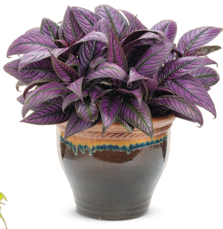
Persian Shield Strobilanthes dyerianus

Notes: Pinch plants once and drench with a preventative fungicide two weeks after transplant. A second pinch is optional based on your container size. Cycocel®, B-Nine® and Bonzi® are all effective at controlling height and internodal stretch. General scouting practices are needed; watch for spider mites, aphids and whiteflies.