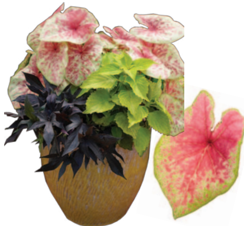
5. Heart to Heart™ 'Raspberry Moon' Sun or Shade