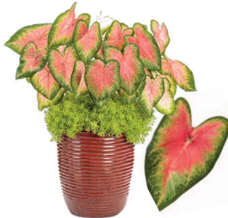
2. Heart to Heart™ 'Rose Glow' Sun or Shade