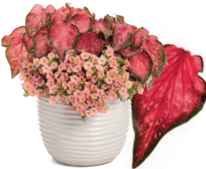
4. Heart to Heart™ 'Scarlet Flame' Sun or Shade