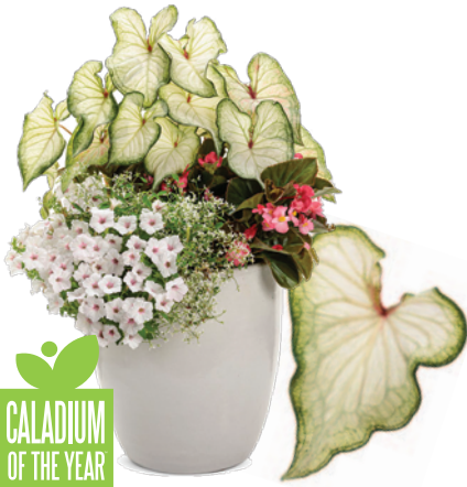
1. Heart to Heart™ 'White Wonder' Sun or Shade