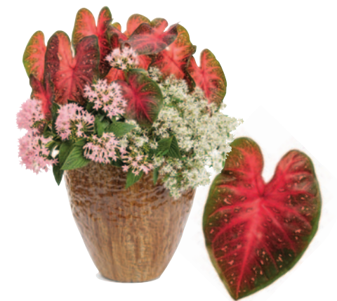
6. Heart to Heart™ 'Fast Flash' Sun or Shade