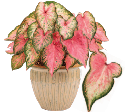
3. Heart to Heart™ 'Blushing Bride' Sun or Shade