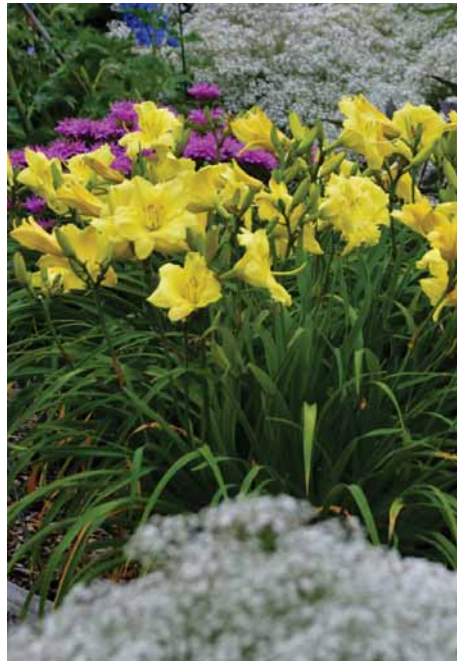
RAINBOW RHYTHM® 'Going Bananas' Hemerocallis

H: 28-32" / W: 34-38" / Z: 4-9 / E: Full Sun