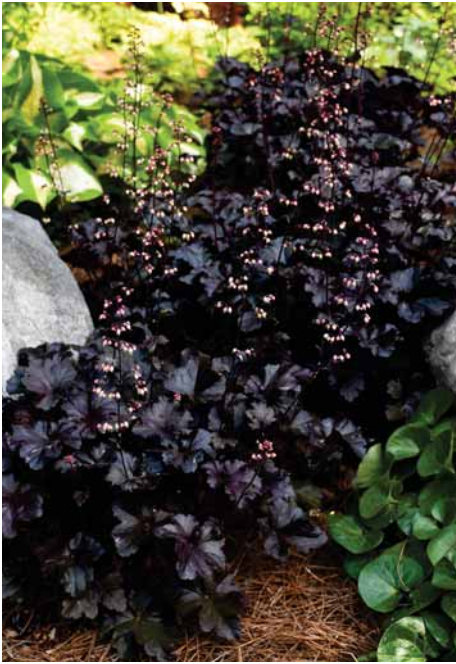
PRIMO® 'Black Pearl' Heuchera

Extremely vigorous and rugged - even in full sun! Very intense black color.