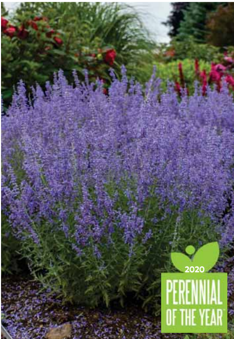
'Denim 'n Lace' Perovskia atriplicifolia

H: 12-24" / W: 10-14" / Z: 5-9 / E: Full Sun