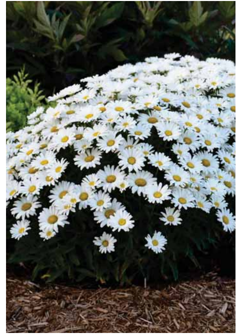
AMAZING DAISIES® DAISY MAY® Leucanthemum superbum

H: 17-20" / W: 24-36" / Z: 3-8 / E: Full Sun