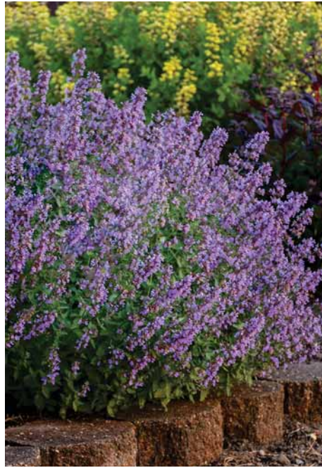
'Cat's Meow' Nepeta faassenii

Tidy, dense habit that keeps its shape all season long.