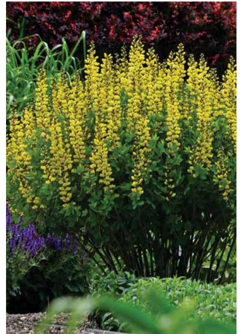
DECADENCE® 'Lemon Meringue' Baptisia

H: 19-22" / W: 18-24" / Z: 3-9 / E: Full Sun