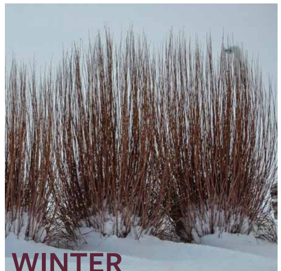
PRAIRIE WINDS® 'Blue Paradise' Schizachyrium scoparium